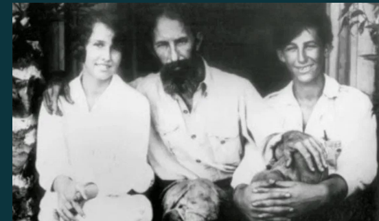
Hijos de quiroga primer matrimonio